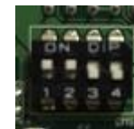
ICT TAO FRONT